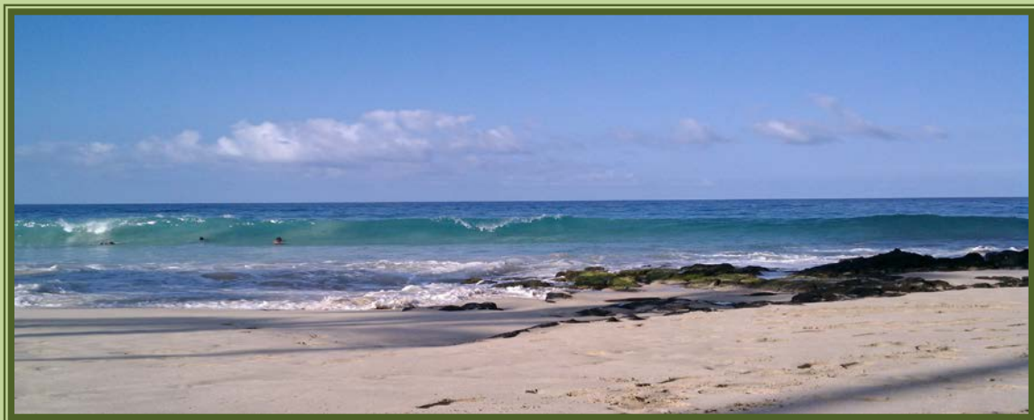
The Big Island, Hawaii

I n broadening their practice from Southern California, to North of Paso Robles through all of San Luis Obispo and Santa Barbara County, it has been imperative for us to keep up with the local rules and customs. Word of mouth has grown our practice considerably and we love helping the people from all of the Central as well as Southern California offices. If you wish to set up an appointment to meet one of the partners in a location near you, please contact them at 1-800-561-6322 to set up an initial consultation.